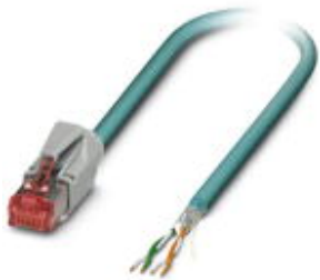
Assembled Ethernet cable, CAT5e, shielded, 2-pair, 26 AWG stranded (7-wire), RAL 5021 (water blue), RJ45 plug/IP20 to free cable end, line, length: 0.5 m

Please be informed that the data shown in this PDF Document is generated from our Online Catalog. Please find the complete data in the user's documentation. Our General Terms of Use for Downloads are valid ( http://phoenixcontact.com/download )