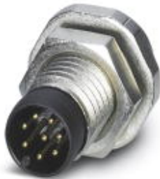
Sensor/actuator flush-type plug-in connector, plug, 8-pos., M8, rear/screw mounting with M8 fastening thread, with straight solder connection

Please be informed that the data shown in this PDF Document is generated from our Online Catalog. Please find the complete data in the user's documentation. Our General Terms of Use for Downloads are valid ( http://download.phoenixcontact.com )